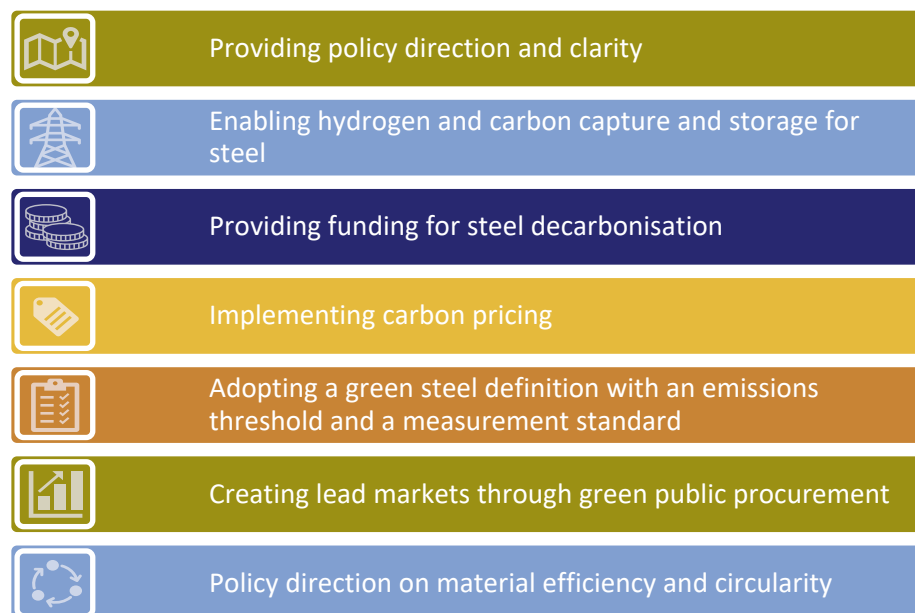
Figure 3. The seven policy levers of the Steel Policy Scorecard

Individually all seven policy measures are important but insufficient tools towards shifting steel production from dirty to clean. There are no silver bullets. Together, however, they would go a long way towards creating the necessary enabling conditions to fully decarbonise the steel sector.